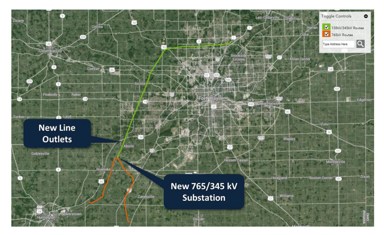
Figure 4: 765 and 345-kV line routes for the Sorenson–Robison Park project.

Ultimately, the BOLD option was chosen for several reasons. The high capacity, low impedance nature of BOLD enabled the use of a single line to help alleviate the PJM-identified violations. BOLD achieves nearly five times the capacity in the same corridor that already existed, and the self-compensating nature of the BOLD design helps boost system voltages without the need for additional voltage support. As mentioned previously, ROW considerations played a heavy part in the final project selection. Land development and encroachments limited the ability to expand the existing Sorenson to Robison Park corridor and left little choice in creating new line routes. Feedback gathered from public open houses indicated that most in the affected communities had a positive impression of the BOLD tower design and profile.