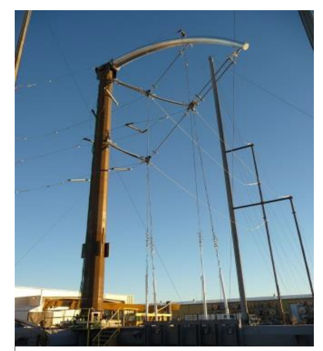
Figure 2: Electrical testing set up

backflashover rate, whether a strike hits the shield wire at the tower or mid-span.