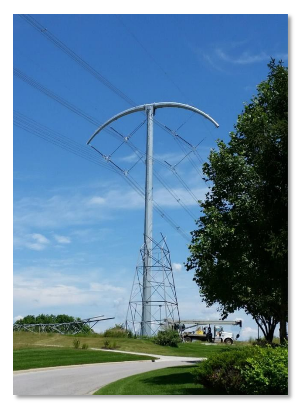
Figure 1: BOLD installation near Fort Wayne, Indiana

BOLD features a streamlined, low-profile structure with phase-conductor bundles arranged into compact delta configurations. The structure of BOLD comprises of an arched cross-arm supporting both